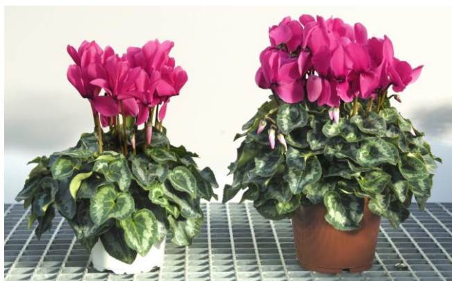
Halios HD Neon rose ref. 2077 - on the left in a 14cm pot grown in the south of France, on the right in a 17cm pot grown in Holland.

In a 17cm pot, Halios® HD offers a generous volume while retaining a round and compact plant structure.