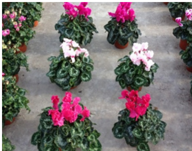
↓ CURLY® untreated CURLY® treated twice with Propiconazole

Trial conducted in the Netherlands, November 2016.